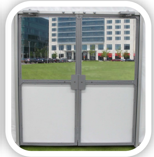
Commodoor inside view