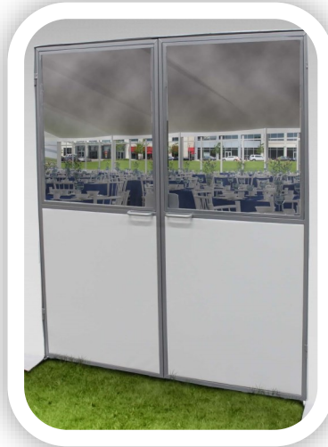
Commodoor outside view